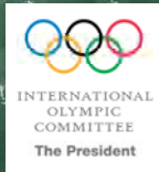
Thomas Bach IOC President